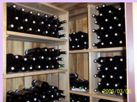
Lots of storage for wine in here!