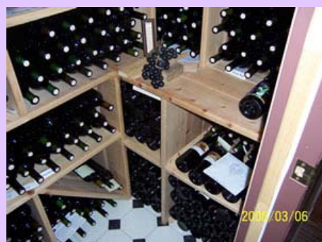
Notice the cooling unit below!