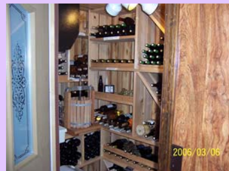
The entrance to the wine cellar

Wine Drops is a catch-all for various tidbits that we find interesting. It may be anything - a wine recipe, a wine joke, links to neat web sites, etc. This month, we offer some photos from the winner of our wine cellar competition.