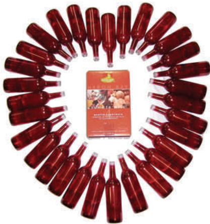
Happy Valentine's Day from grapestompers

If you've got a special request for any new wine-related gift, additive, or supply, be sure to call Tom and let him know about it - and we'll be on the lookout for you!