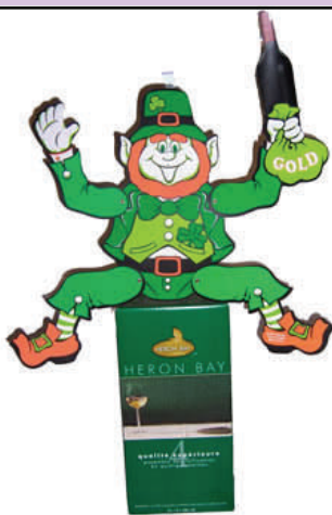
Happy St. Patrick's Day from grapestompers

If you should ever visit a site that requests credit card information without a visible secure certificate, our advice is to stay away from that merchant and do not consummate a purchase from that particular web site. Should your credit card ever get compromised, report it to your bank immediately.