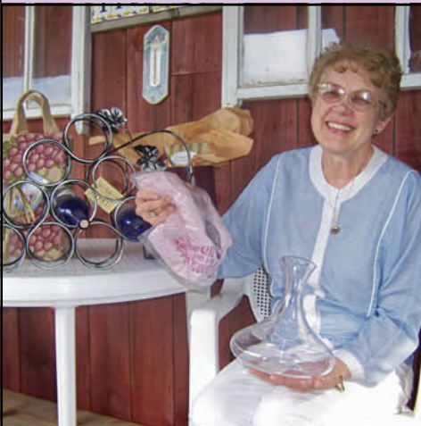
Happy Mother's Day from grapestompers

*DISCLAIMER: Some rumors come true, some don't. It's a risk we're willing to take.