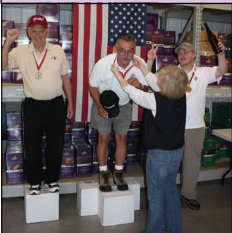
Medal ceremony at grapestompers.com