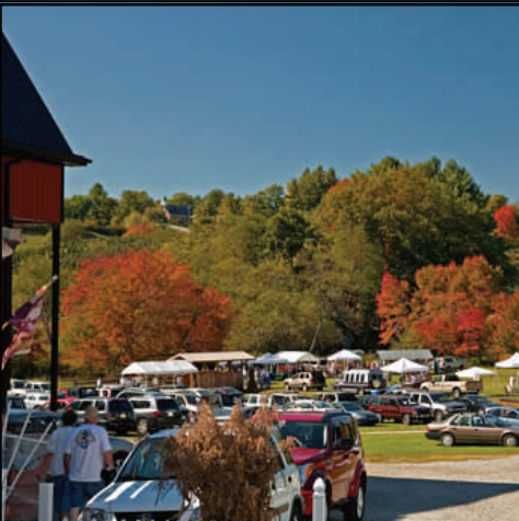
Fall colors seen at annual wine festival