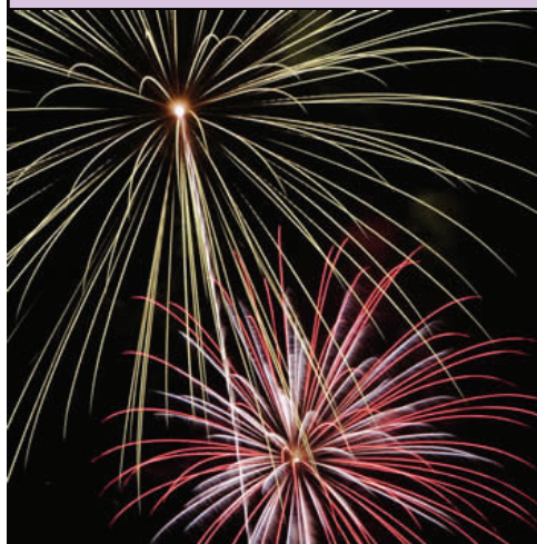
Happy 4th of July from grapestompers!

Item # WE3171 Special price: $105.46 Read the special flyer