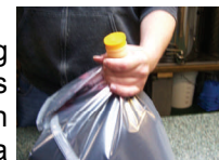
Continued on page 4