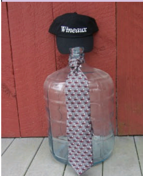
HAPPY FATHER'S DAY From Grapestompers!

Thanks again to everyone from Tom and the grapestompers gang!